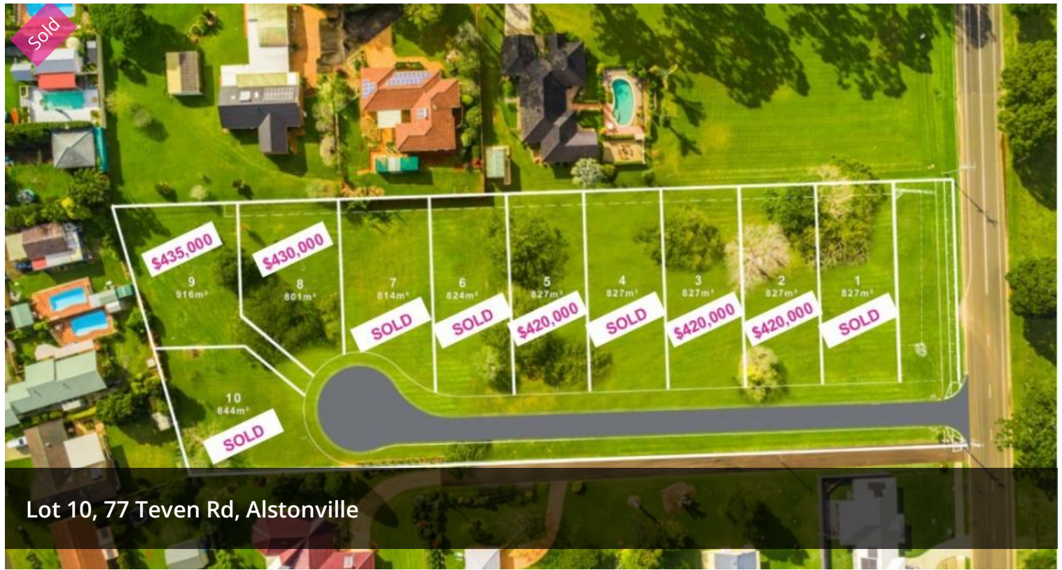
Lot 10, 77 Teven Rd, Alstonville