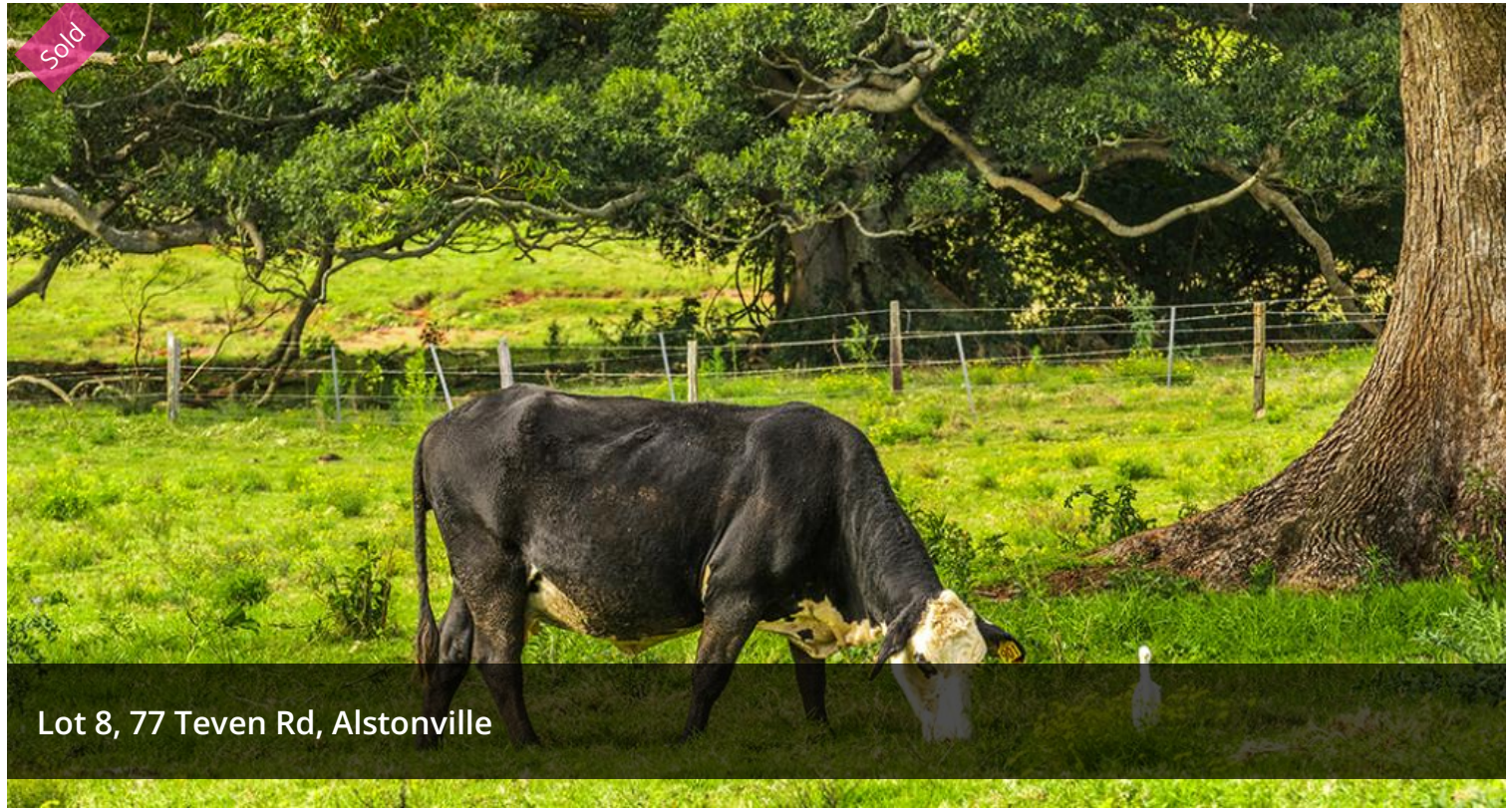
Lot 8, 77 Teven Rd, Alstonville