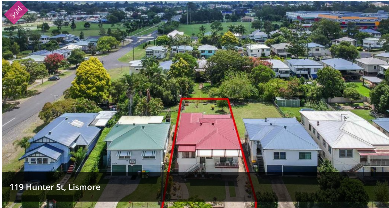
119 Hunter St, Lismore