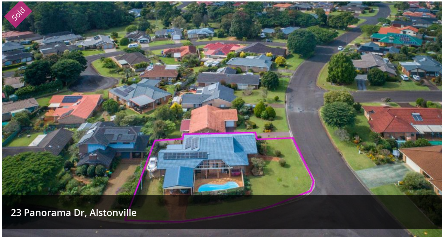
23 Panorama Dr, Alstonville