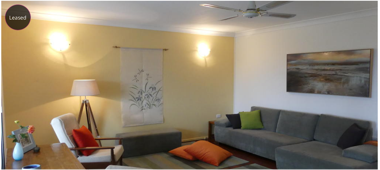
Unit 1, 6 Shoalhaven St, Alstonville