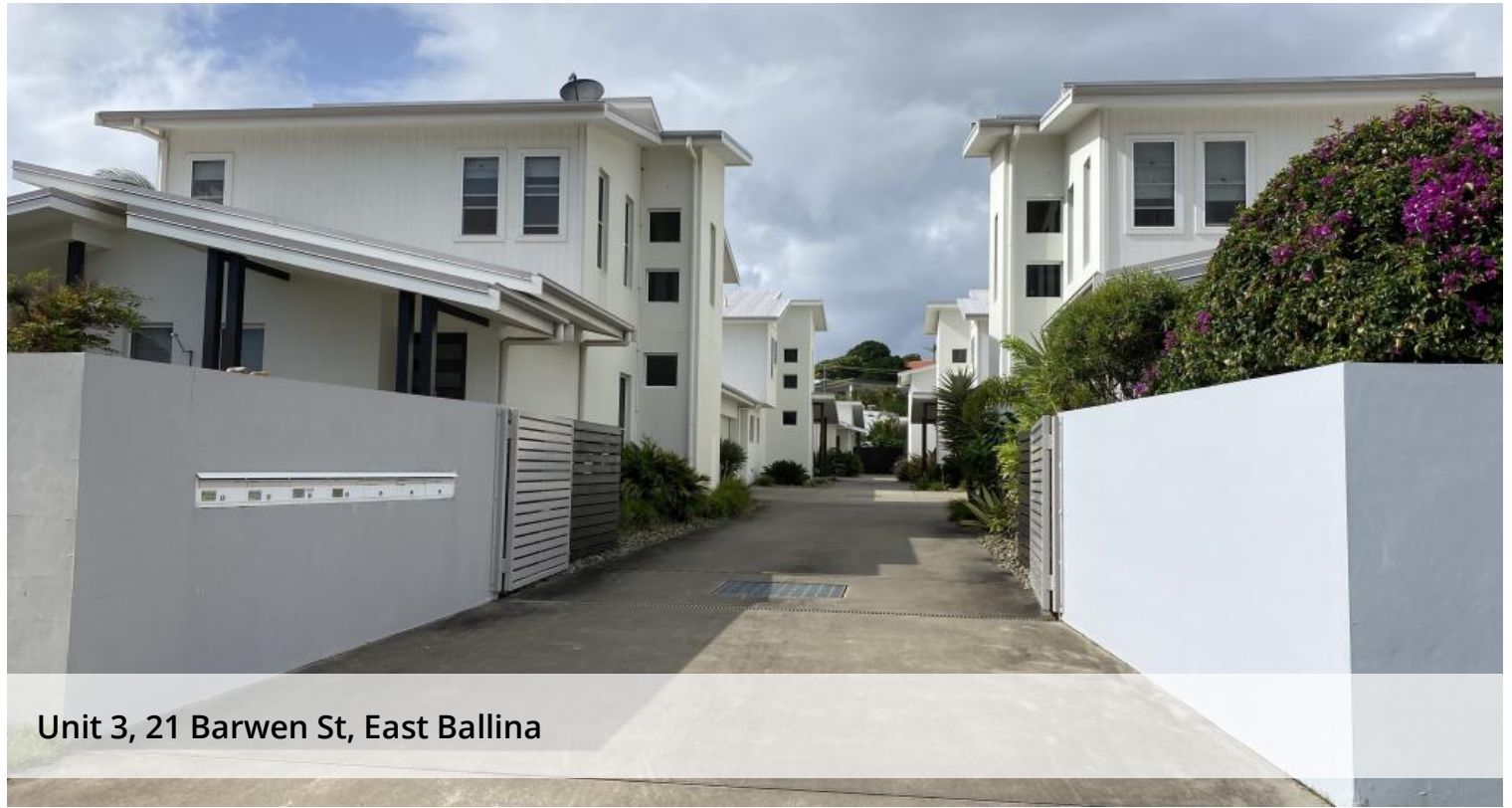
Unit 3, 21 Barwen St, East Ballina