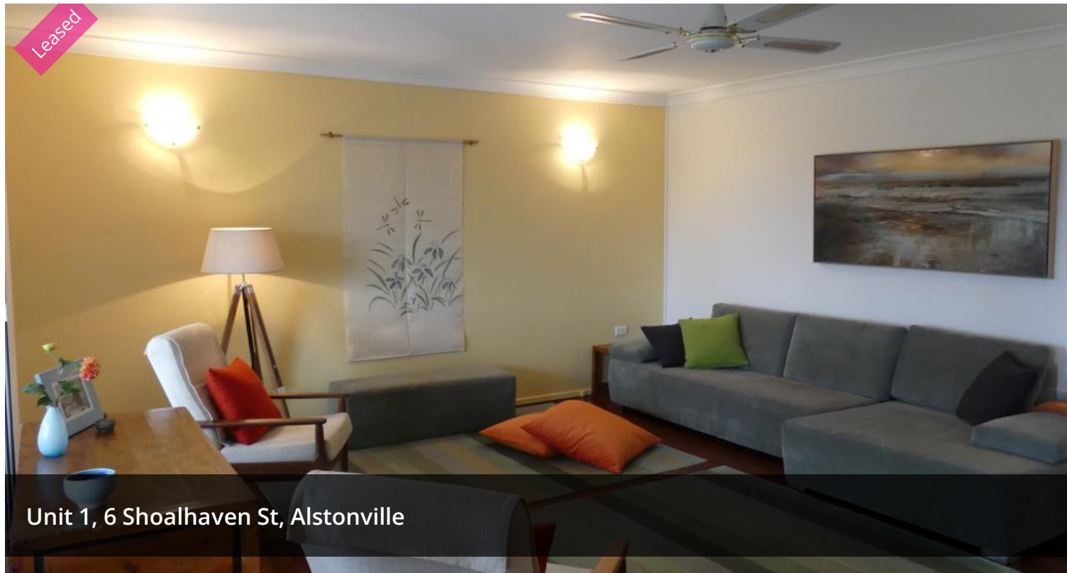
Unit 1, 6 Shoalhaven St, Alstonville