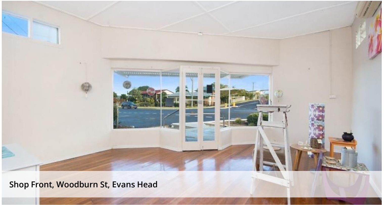
Shop Front, Woodburn St, Evans Head