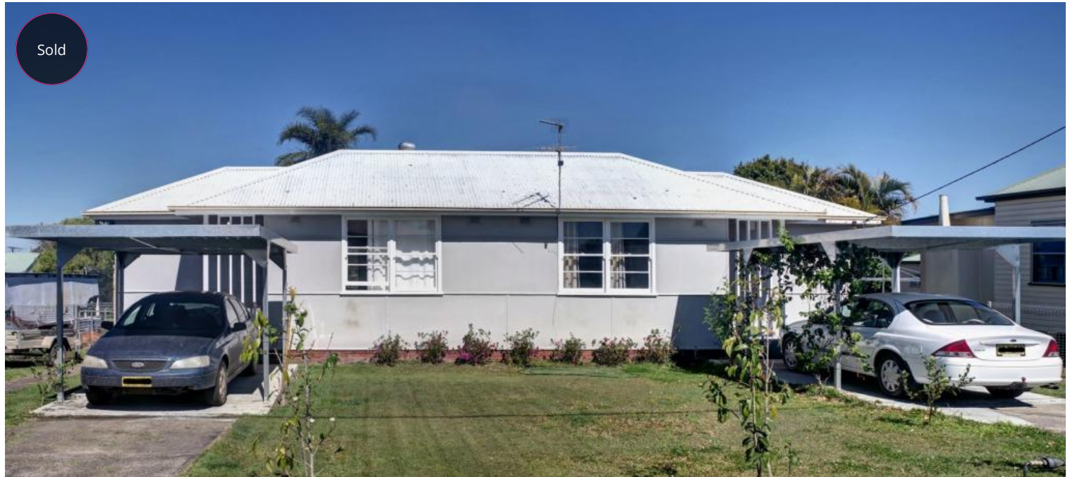
19a & 19b Mcdougall St, Casino